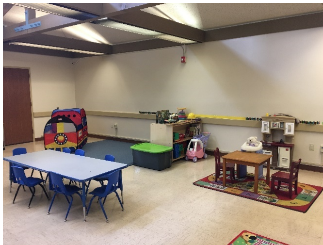
Picture 8: Community Center playgroup location. Low attendance. Lacked warmth and curriculum-focused arrangement, felt cold and sparse.