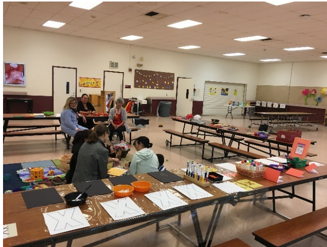
Picture 7: Mobile Playgroup in school cafeteria. Provided floor mat, curriculum-rich activity stations, warm and welcoming.