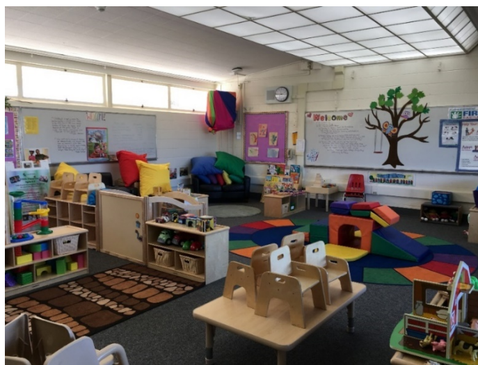
Picture 4: Playgroup located within Preschool Center exemplified all key criteria: safe space with best-fit furniture, including infant/toddler changing station, curriculum-rich stations, warm and inviting decorations, well-labeled supplies within reach.