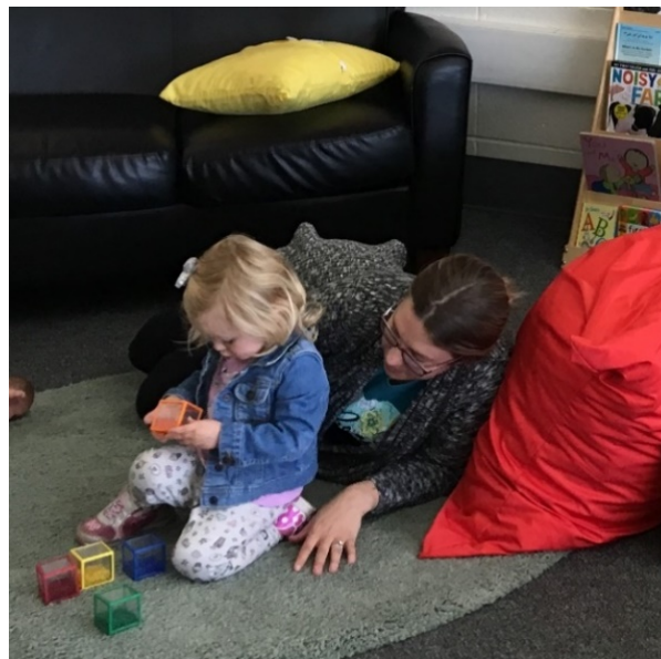
Picture 10: Developmental playgroups teach parents and children how to establish ideal parent/child engagement, while laying the foundation for school readiness.

“This playgroup taught me what kind of mom I want to be.” - Parent