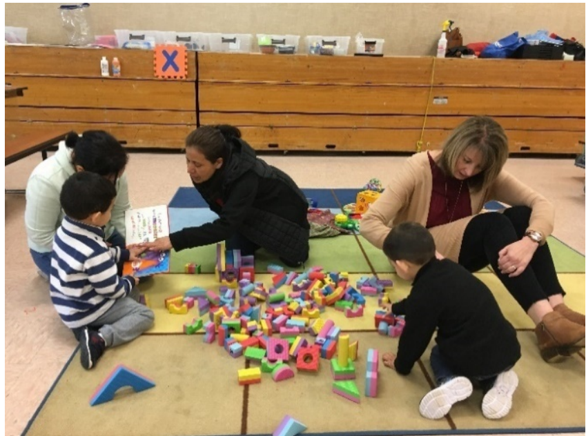
Picture 1: This site exemplifies high parent/child and staff/child engagement.

The benefits of developmental playgroups have been noted to improve a broad range of learning and psychosocial outcomes for both children and their parents/caregivers, including providing an important community support for parents with young children from diverse communities 1 . Leading experts from Australia's playgroup sector—renowned for their government-supported, robust early childhood education initiatives—note that developmental playgroups provide five common benefits for children and caregivers: 1) offer opportunities for creative, unstructured learning through play, 2) build attachments between adults and children as they play together and share time and experiences, 3) help children develop social skills as they learn to interact with others, take turns, share, and make friends, 4) provide experiences that enable them to manage stress and cope with change, and 5) offer opportunities for children to explore, invent, reason, and solve problems 2 .