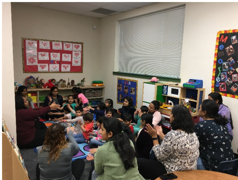
Picture 5: Tight converted space, yet warm. High parent/child/staff engagement.

The numbered pictures here portray the variety of site locations and their varied classroom environments. Pictures 3-4 scored highest for classroom environment (i.e., exhibited the key indicators per dimension), pictures 5-7 portray sites with constraints that were still able to provide a thoughtful and appropriate classroom environment, compared to picture 8 of the site at the Community Center, which lacked warmth and thoughtful arrangement.