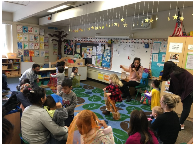
Picture 9: This site demonstrated ideal parent/child/teacher interaction: engaging, playful, and interactive with appropriate props.

This was observed on-site, as the facilitator not only engaged parents and children in a stimulating manner through movement, song, and curriculum, but also went beyond the basics and connected parents and children with hands-on resources. For example, during Welcome Circle, when some children became loud and lost focus after dancing with scarves (see picture), the facilitator refocused the group by bringing out a Kinex-style ball that expands and contracts, and encouraged the children to take a breath in when the ball expanded, and out when the ball contracted, noting to parents that this ball is "a great tool to keep in your diaper bag for when you are out in public and need to refocus your child's attention."