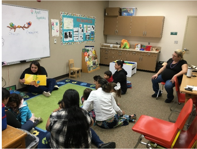
Picture 6: School office converted to temporary playgroup room. Small, yet warm, safe, and thoughtful curriculum-rich activity stations.