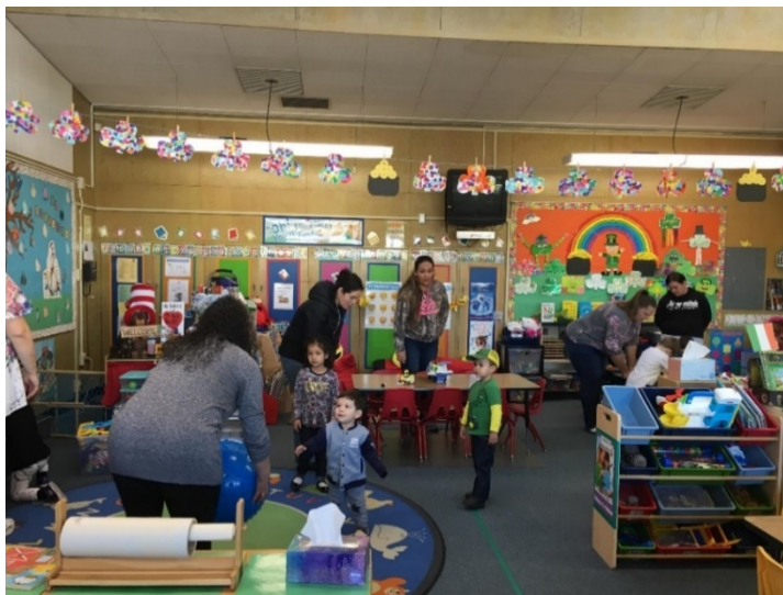
Picture 3: One of the classrooms that exemplified an ideal environment: thoughtfully arranged stations, warmly decorated, curriculum-rich supplies/toys.