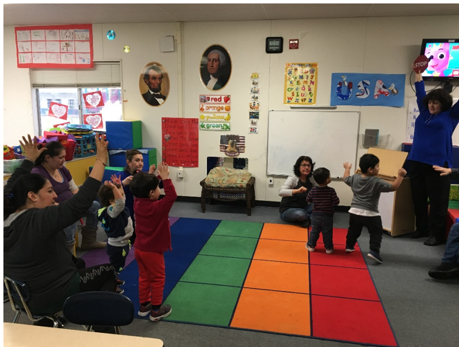
Picture 2: One of the classrooms that exemplified ideal curriculum integration with high parent/child/teacher engagement, through singing and movement.

The following sections offer more specific findings for each of the four dimensions assessed.